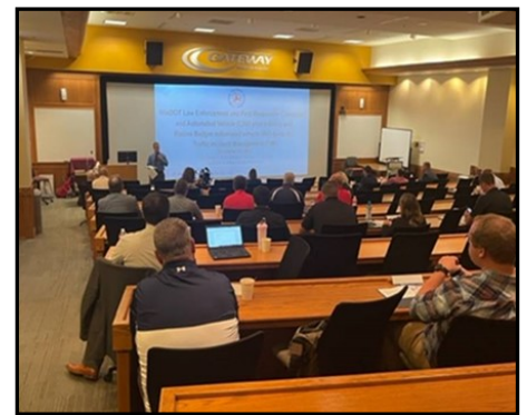
*Photo from the WisDOT CAV First Responder Training and Racine Badger Shuttle Demonstration

The campaign continued with the LE&FR Subcommittee working on a law enforcement and first responders specific CAV training initiative. The training is designed to provide basic information on CAVs, the legal status of CAVs in Wisconsin and managing incident scenes that include a CAV. The Department piloted the training at the Gateway Technical College in Racine to law enforcement and first responders TIM instructors. The pilot included a demonstration of the Racine Badger, an automated shuttle, which is located at the technical college. Due to the location of the Racine Badger, TIM instructors from the southeast region and surrounding areas were invited to participate. Participants were asked to provide feedback on the training, including gauging level of effectiveness of the training and applicability of information provided. While the LE&FR Subcommittee is analyzing the results of the feedback, many participants found the training very helpful and would like to see updated versions as the CAV technology advances in the future. The subcommittee will continue to review the participants’ input and revise the training as needed with the goal of including a CAV component in the statewide traffic incident management training that WisDOT hosts.