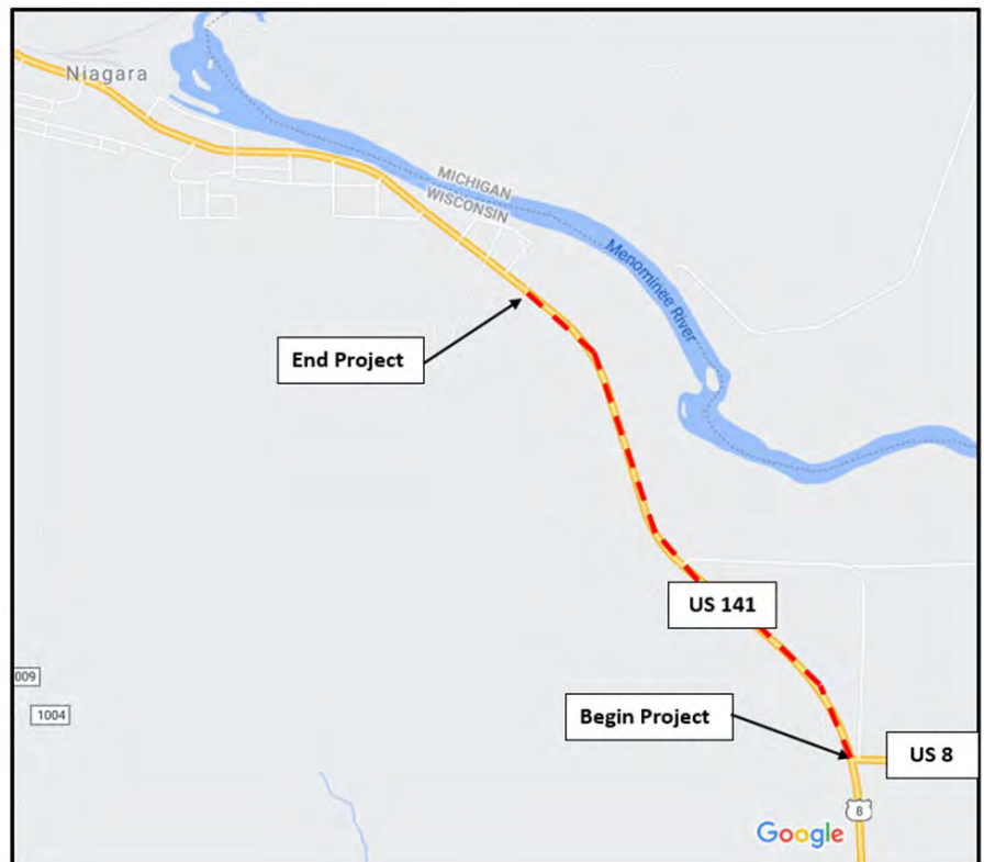
Project Location Map