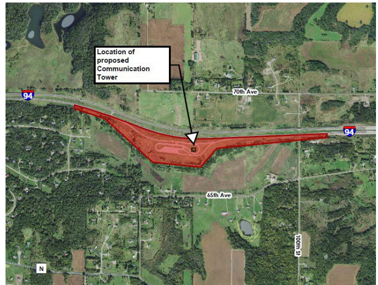
Hudson SWEF - St. Croix County

https://wisconsindot.gov/Pages/projects/by-region/nw/i94swef/default.aspx