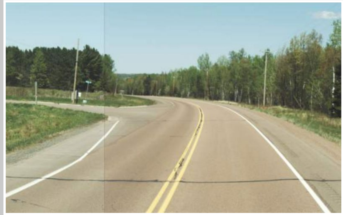
Northbound WIS 13 approaching Engoe Road