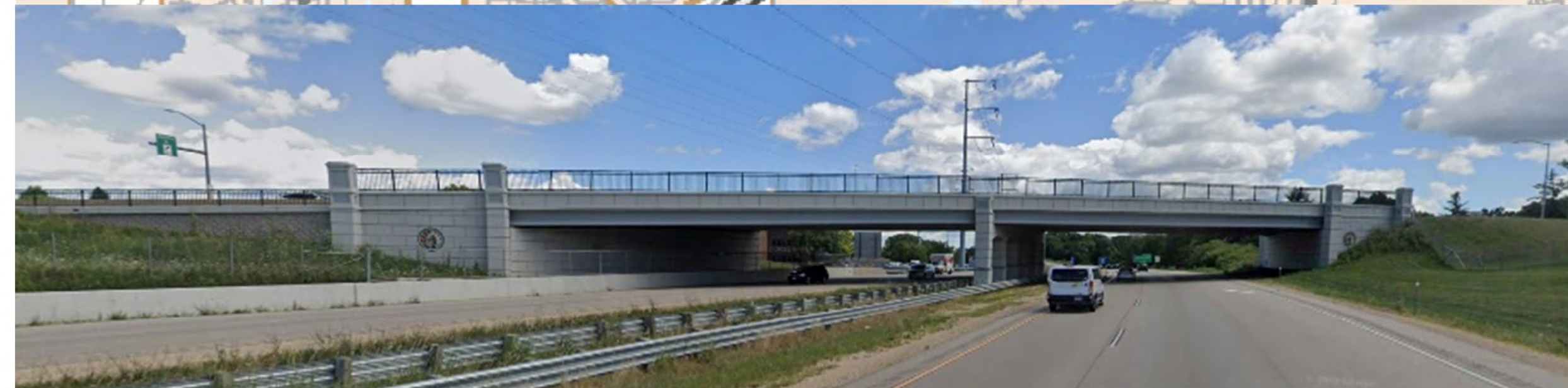
Example: High Point Rd. over Beltline, Source: Google 2022