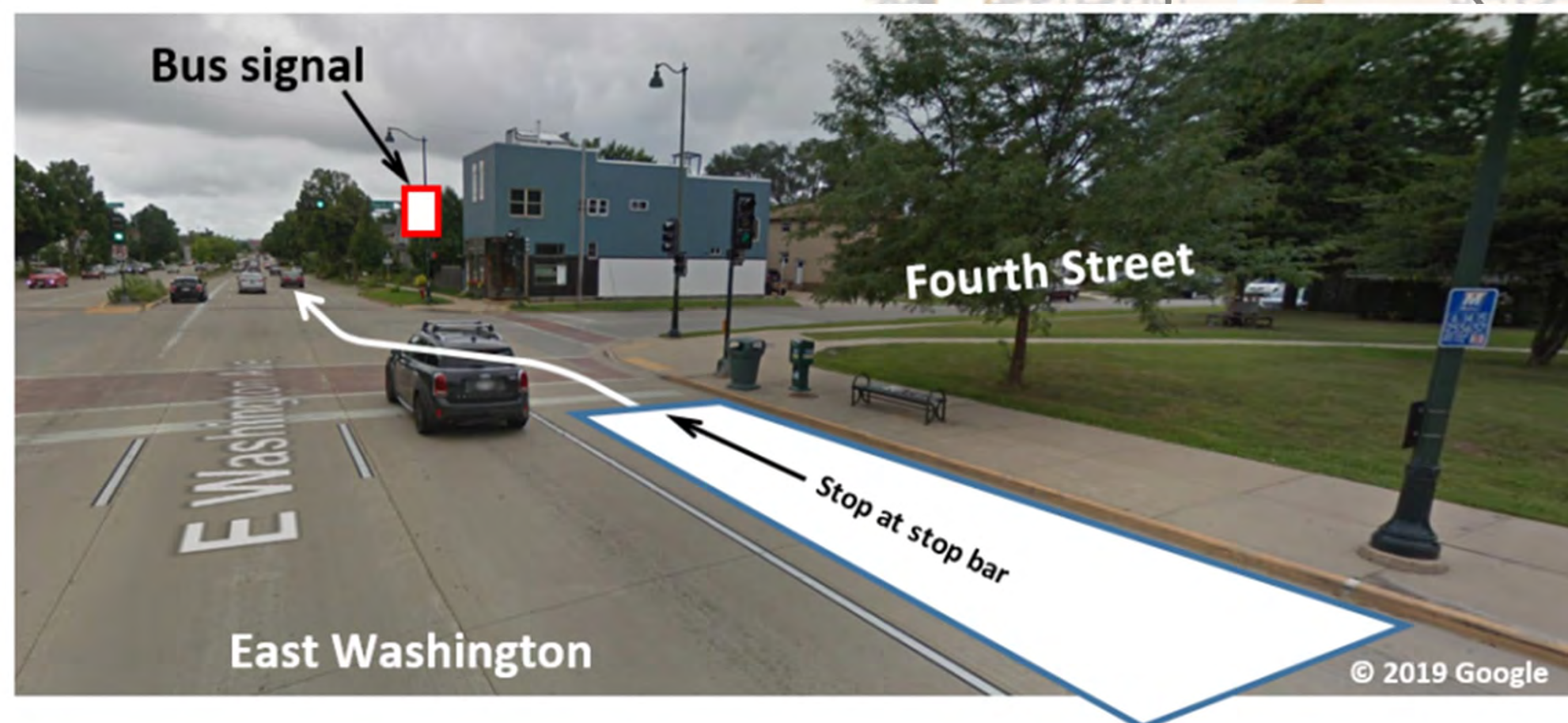
Example: Transit Signal Priority, Source: Madison Metro Transit

Dashed green line shows proposed Bus Rapid Transit route; Dashed blue line shows Bus Rapid Transit Route under construction