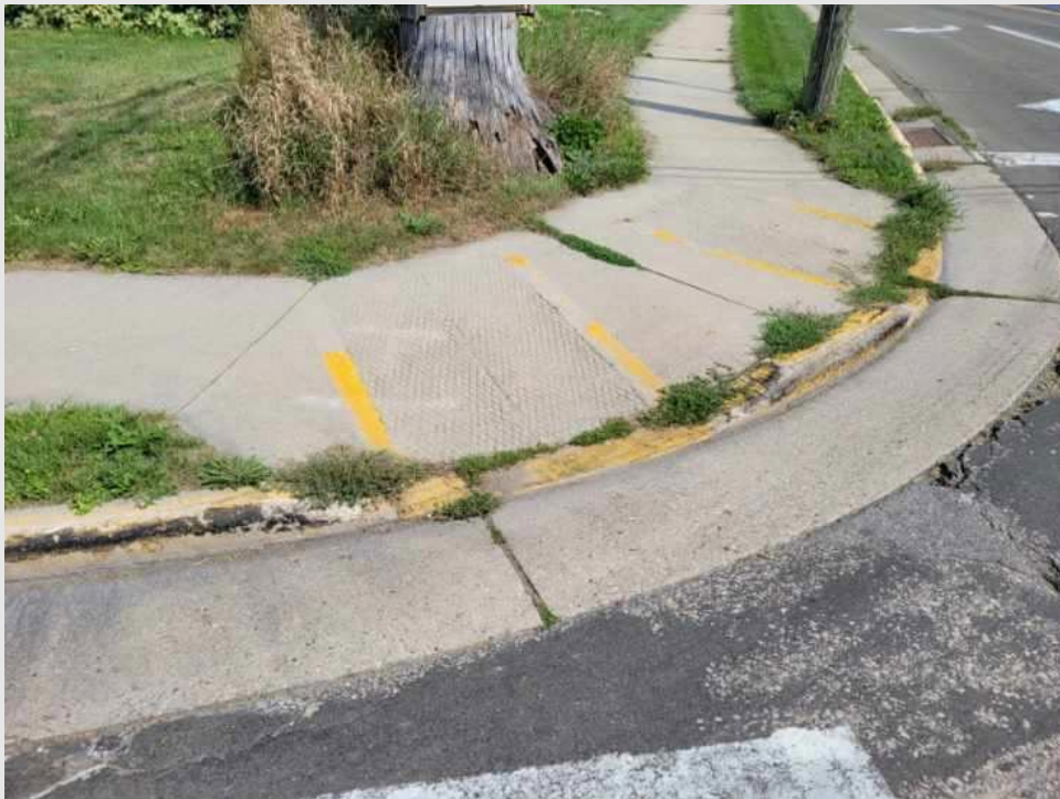
NW quad of Windsor/Bristol St intersection