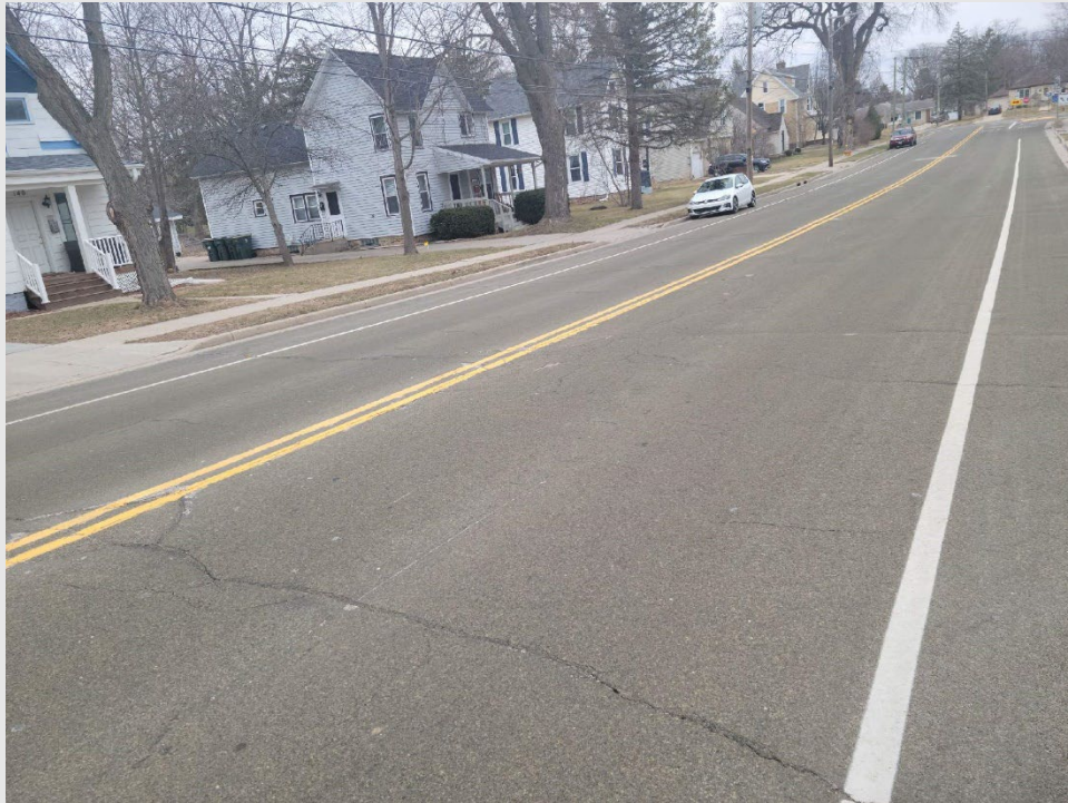
Cracking along Windsor Street