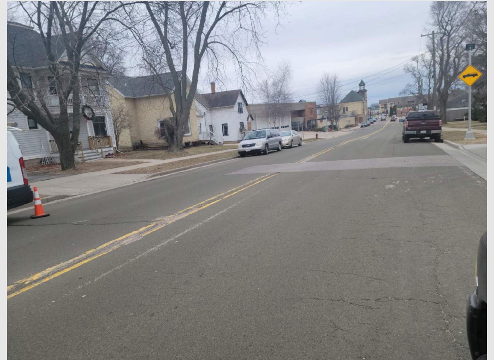
Cracking along North Bristol Street