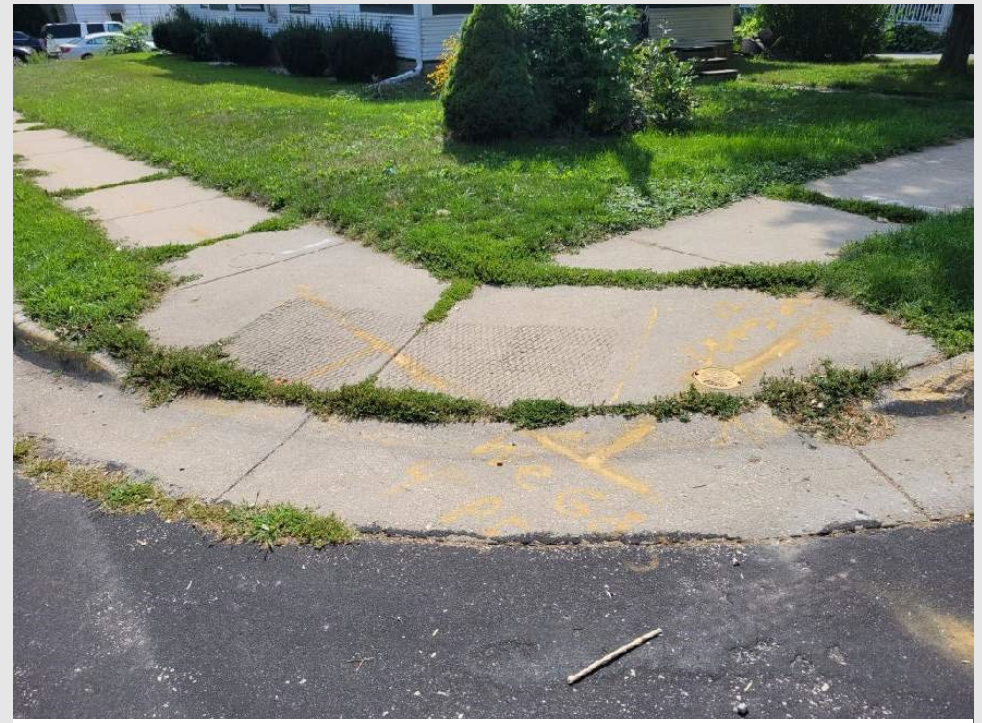
SE quad of Windsor/North St intersection