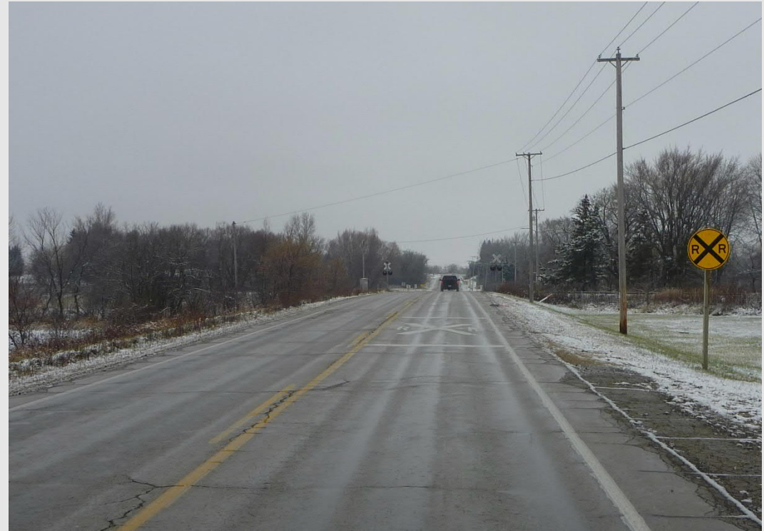
Existing WIS 26