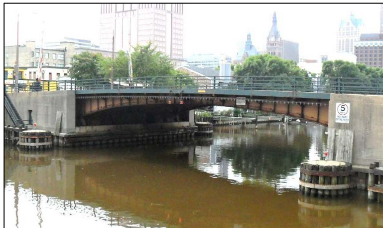
Figure 2.7.1-19: Assessment 9290 – Dolphin or Fender System.

It is the inspector’s task to examine each system and reasonably assign the most severe assessment condition to each assessment. This will quantify the assessment’s state of deterioration and help generate quantity/cost estimates for future remedial work.