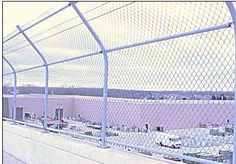
Figure 2.7.1-26: Assessment 9337 – Protective Screening

It is the inspector’s task to examine each protective screening assessment and reasonably assign the most severe assessment condition to each assessment. This will quantify the assessment’s state of deterioration and help generate quantity/cost estimates for future remedial work.