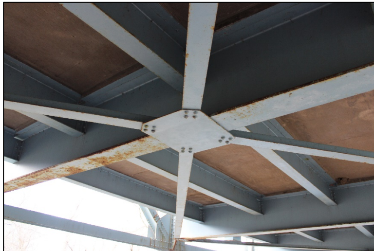
Figure 2.7.1-16: Assessment 9169 – Lateral Bracing.

It is the inspector’s task to examine each lateral bracing system and reasonably assign the most severe assessment condition to each assessment. This will quantify the assessment’s state of deterioration and help generate quantity/cost estimates for future remedial work.