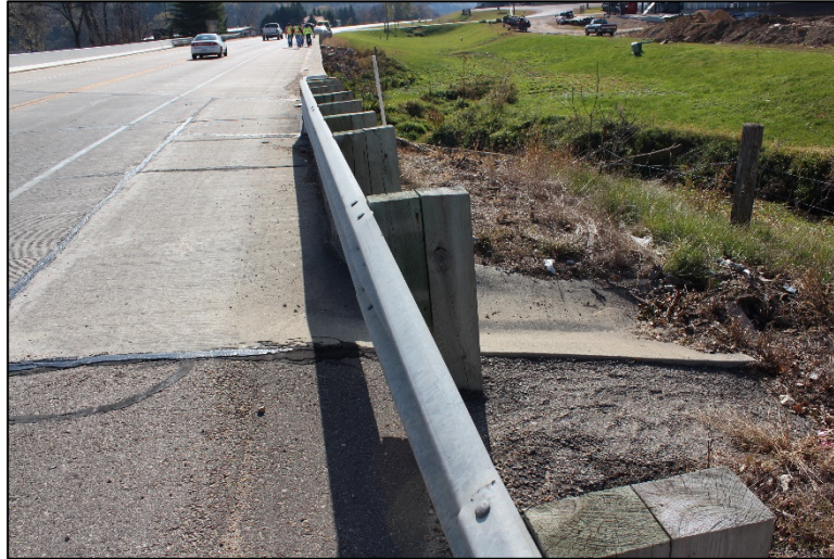
Figure 2.7.1-1: Assessment 9001 – Approach Drainage. Note concrete flume.

It is the inspector's task to examine each approach drainage assessment and reasonably assign the most severe assessment state to the "each" quantity. This will quantify the assessment's state of deterioration and help generate quantity/cost estimates for future remedial work.