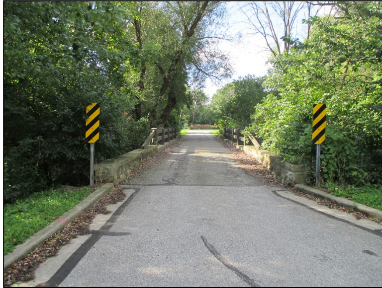
Figure 2.7.1-8: Assessment 9030 – Signs – Object Markers.