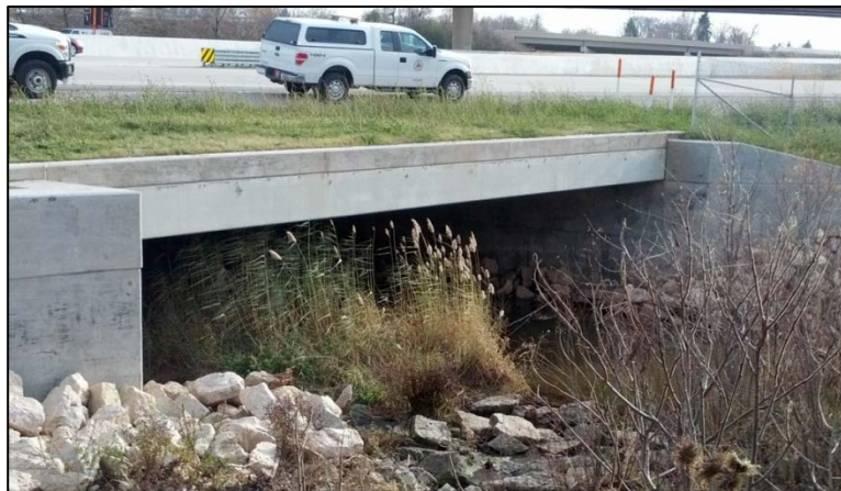
Figure 2.7.1-23: Assessment 9325 – Roadway over Structure.

It is the inspector's task to examine each roadway and reasonably assign the most severe assessment condition to each assessment. Quantifying these amounts helps to generate quantity/cost estimates for future remedial work.