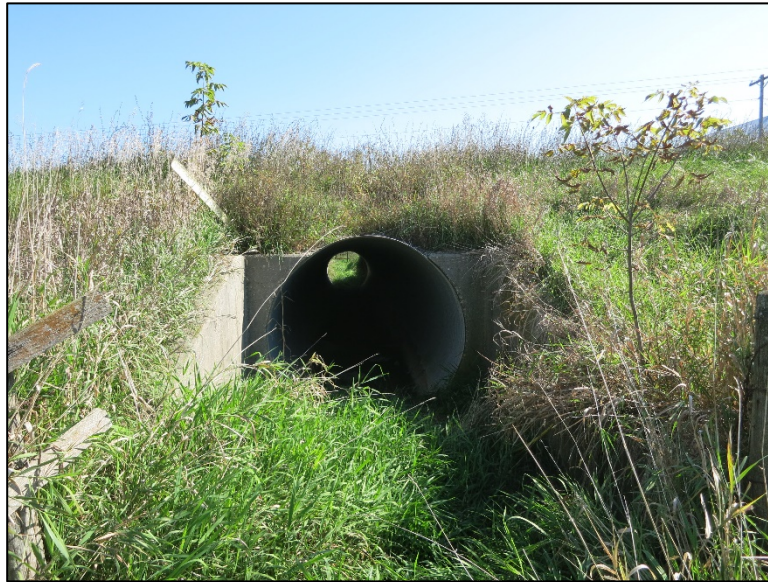
Figure 2.7.1-17: Assessment 9248 – Culvert End Treatment.