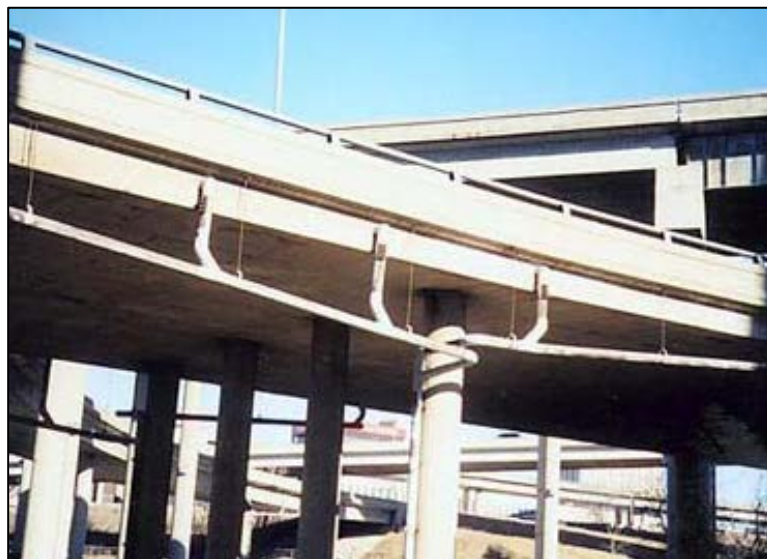
Figure 2.7.1-2: Assessment 9004 – Deck Drainage.

It is the inspector’s task to examine all deck drainage and reasonably assign the most severe assessment condition to each drain found within the limits of the bridge deck. This will quantify the assessment’s state of deterioration and help generate quantity/cost estimates for future remedial work.