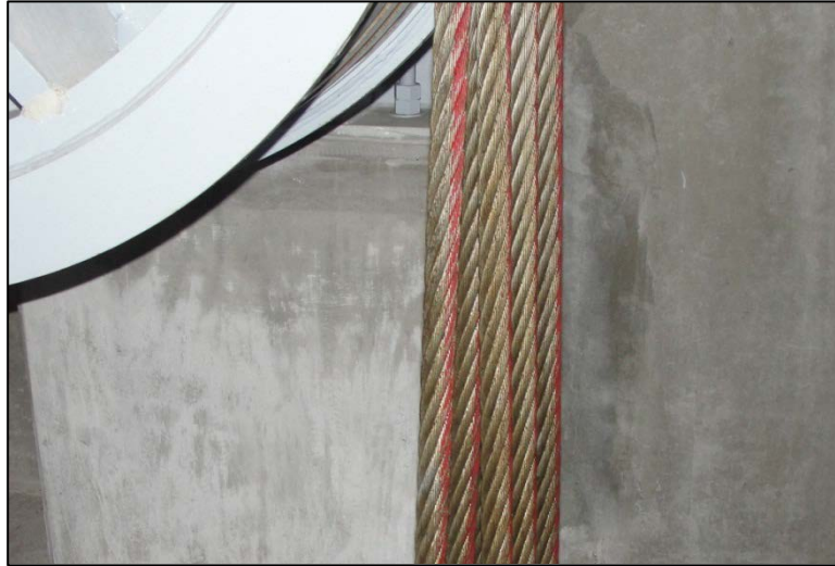
Figure 2.7.1-7: Assessment 9021 – Movable Bridge Cables.