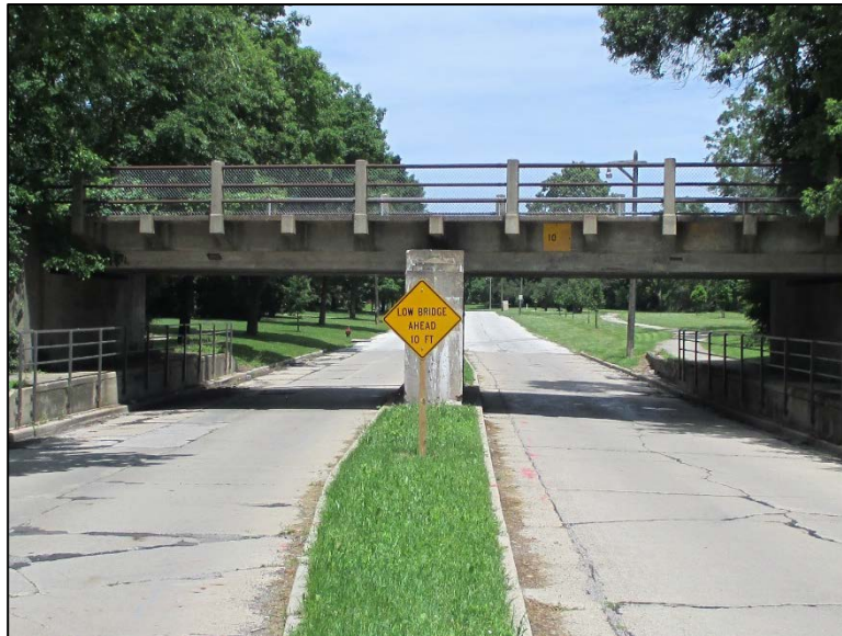
Figure 2.7.1-9: Assessment 9033 – Signs – Vertical Clearance.

It is the inspector's task to examine each sign and reasonably assign the most severe assessment condition. This will quantify the assessment's state of deterioration and help generate quantity/cost estimates for future remedial work.