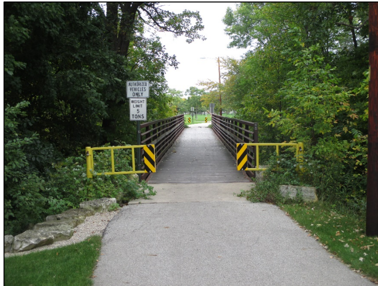
Figure 2.7.1-10: Assessment 9034 – Signs – Weight Limit Posting.

It is the inspector's task to examine each sign and reasonably assign the most severe assessment condition. This will quantify the assessment's state of deterioration and help generate quantity/cost estimates for future remedial work.