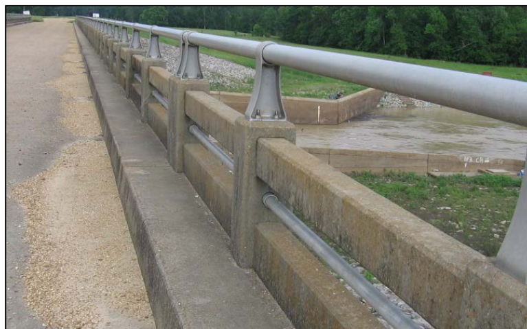
Figure 2.7.1-24: Assessment 9335 – Decorative Rail.

It is the inspector’s task to examine each decorative rail assessment and reasonably assign the most severe assessment condition to each assessment. This will quantify the assessment’s state of deterioration and help generate quantity/cost estimates for future remedial work.