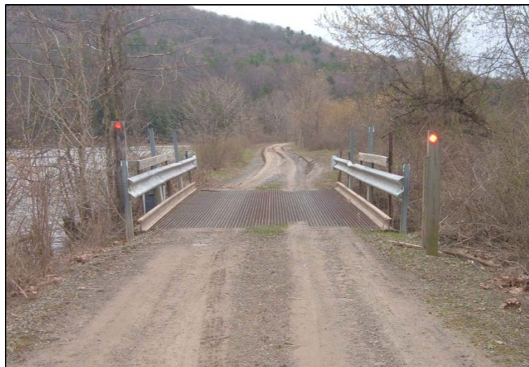
Figure 2.7.1-22: Assessment 9324 – Gravel Approach Roadway.

It is the inspector’s task to examine each system and reasonably assign the most severe assessment condition to each assessment. This will quantify the assessment’s state of deterioration and help generate quantity/cost estimates for future remedial work.