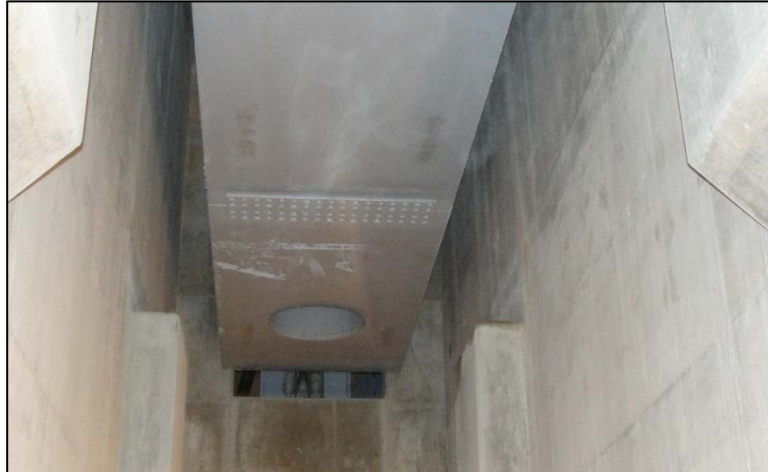
Figure 2.7.1-6: Assessment 9020 – Movable Bridge Counterweight.