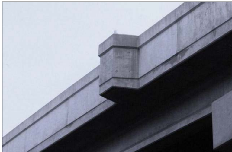
Figure 2.7.1-25: Assessment 9336 – Luminaire Bases.

It is the inspector’s task to examine each luminaire base and reasonably assign the most severe assessment condition to each assessment. This will quantify the assessment’s state of deterioration and help generate quantity/cost estimates for future remedial work.