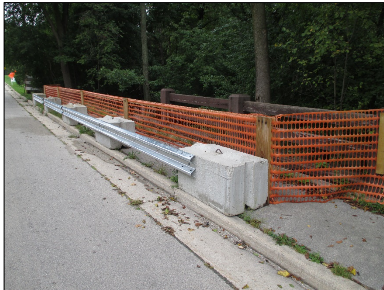
Figure 2.7.1-11: Assessment 9036 – Bridge Closure System. Note assessment used for sidewalk closure.

It is the inspector’s task to examine each bridge closure system and reasonably assign the most severe assessment condition to each assessment. This will quantify the assessment’s state of deterioration and help generate quantity/cost estimates for future remedial work.