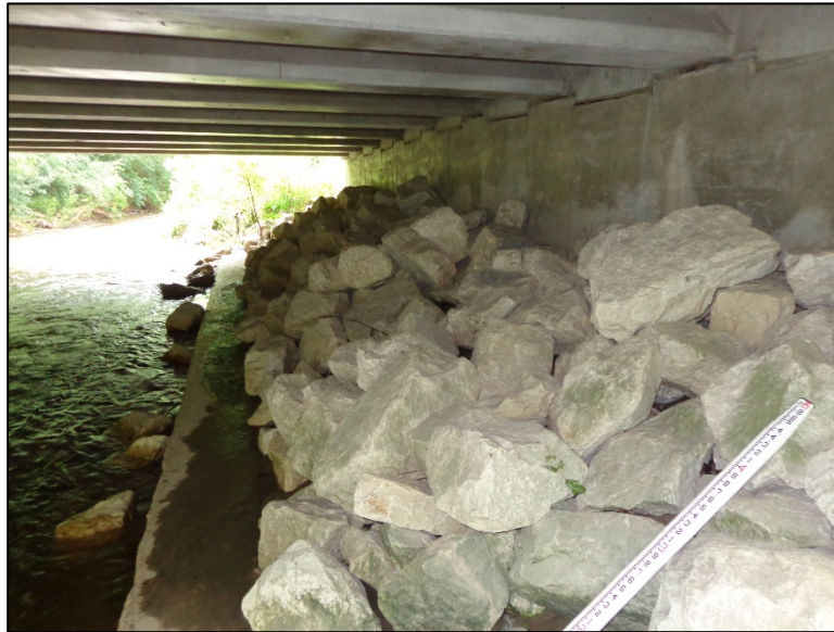
Figure 2.7.1-13: Assessment 9045 – Slope Protection – Riprap.