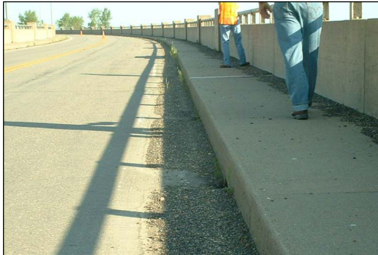
Figure 2.7.1-3: Assessment 9009 – Sidewalk.

It is the inspector's task to examine each sidewalk and reasonably assign the most severe assessment condition to the each assessment. This will quantify the assessments state of deterioration and help generate quantity/cost estimates for future remedial work.