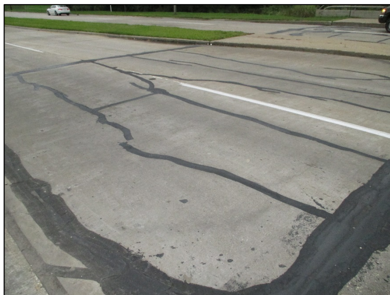
Figure 2.7.1-20: Assessment 9322 – Concrete Approach Roadway.

It is the inspector’s task to examine each system and reasonably assign the most severe assessment condition to each assessment. This will quantify the assessment’s state of deterioration and help generate quantity/cost estimates for future remedial work.