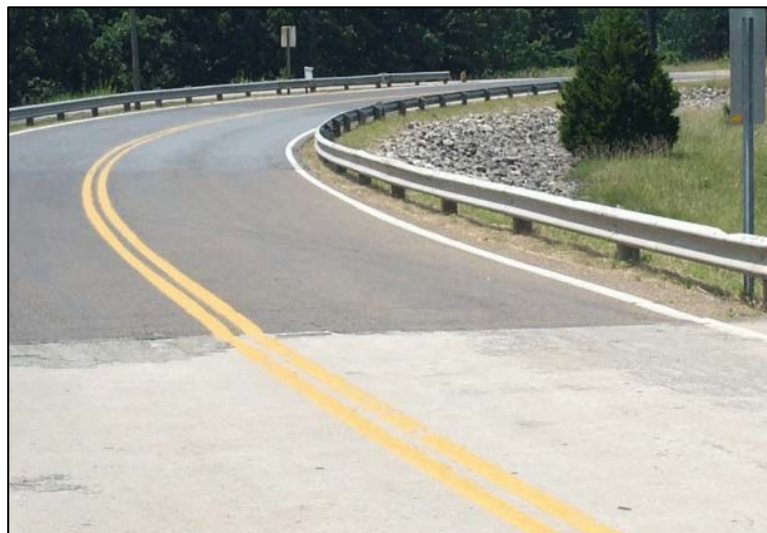
Figure 2.7.1-21: Assessment 9323 – Asphalt Approach Roadway.

It is the inspector’s task to examine each system and reasonably assign the most severe assessment condition to each assessment. Quantifying these amounts helps to generate quantity/cost estimates for future remedial work.