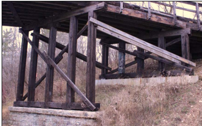
Figure 2.7.1-18: Assessment 9250 – Cross Bracing or Struts.

It is the inspector’s task to examine each system and reasonably assign the most severe assessment condition to each assessment. This will quantify the assessment’s state of deterioration and help generate quantity/cost estimates for future remedial work.