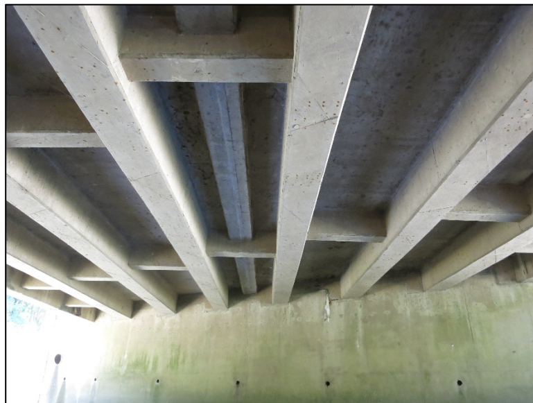
Figure 2.7.1-15: Assessment 9168 – Concrete Diaphragm.

It is the inspector’s task to examine each diaphragm and reasonably assign the most severe assessment condition to each assessment. This will quantify the assessment’s state of deterioration and help generate quantity/cost estimates for future remedial work.