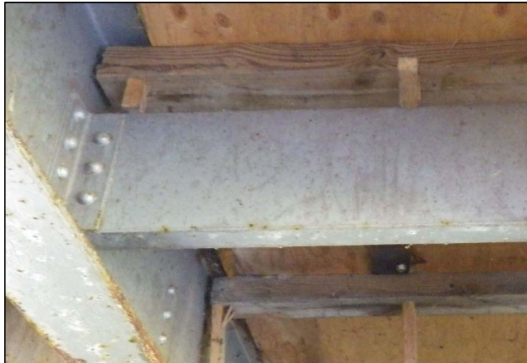
Figure 2.7.1-14: Assessment 9167 – Steel Diaphragm.

It is the inspector's task to examine each diaphragm and reasonably assign the most severe assessment condition to each assessment. This will quantify the assessment's state of deterioration and help generate quantity/cost estimates for future remedial work.