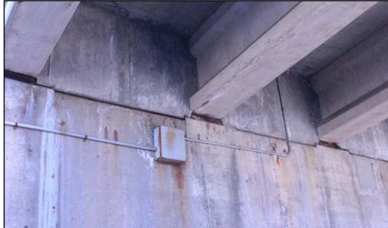
Figure 2.7.1-5: Assessment 9011 – Utilities.