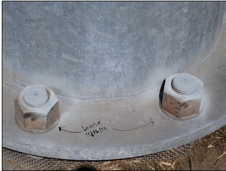
Figure 4.3.3-5: View of Loosened Anchor Rods. Note No Jam Nuts Over Anchor Nuts. Condition State 4 (2 Each).