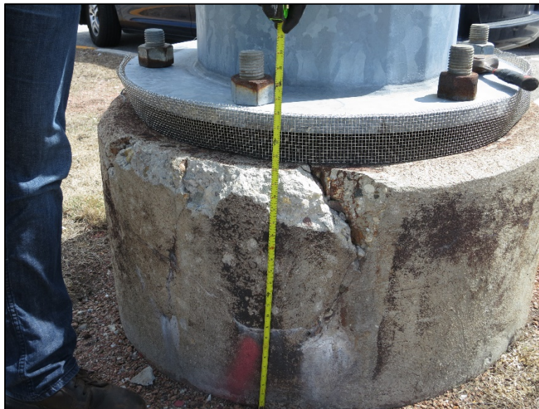
Figure 4.3.3-3: View of a Delaminated/Spalled Concrete Foundation – Condition State 3.

Reinforced concrete bases and foundations are made by placing ready-mix concrete into slip forms steel reinforcing throughout the foundation. The soil adhesion, skin friction, and bearing pressure resist loading from the structure.