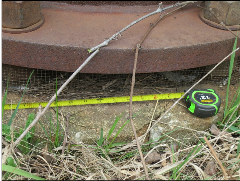
Figure 4.3.4-1: View of Rodent Screen between Base Plate and Foundation.

Refer to the following assessment states: