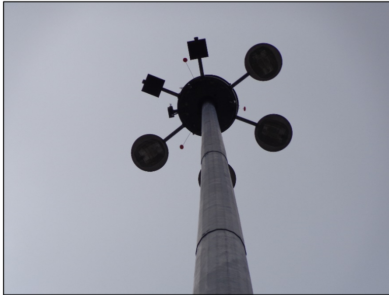
Figure 4.3.4-2: View of Luminaire Ring.

Refer to the following assessment states: