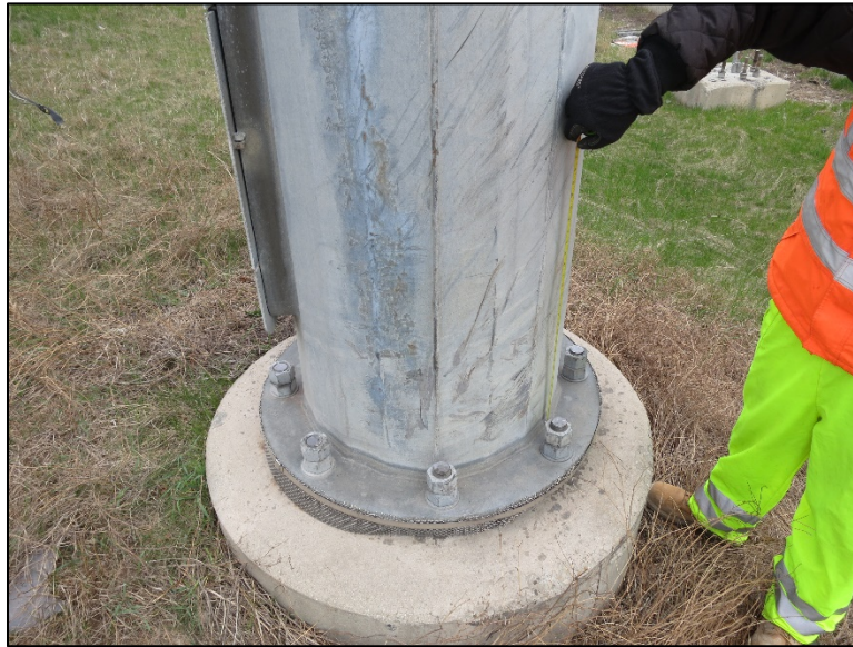
Figure 4.3.3-7: View of Minor Scraping Exhibited at the Bottom of the Vertical Pole. (Condition State 2).