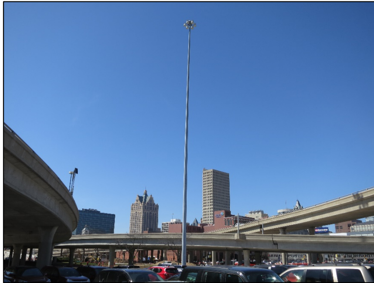
Figure 4.3.3-1: Overall View of a Typical High Mast Light Tower.