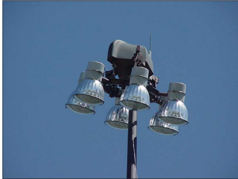
Figure 4.3.5-4: View of a Misaligned Luminaire Ring.

Refer to Figure 4.3.5-5 for a close-up view of the hatch doors on an old and a new high mast light tower. There are differences in the door design on the older structures as shown on the left compared to the new structures as shown on the right. The new door is secured with bolts, a lock in easily accessible areas such as Park and Rides, and no longer has a latch. Note that the electrical circuit plaque has not yet been installed on the new structure.