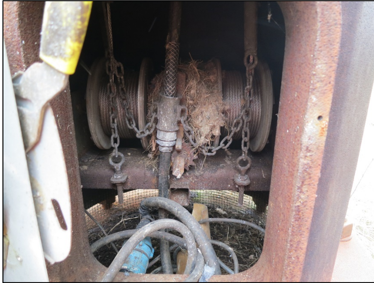
Figure 4.3.4-3: View of an Internal Winch System. Note Nesting Material Located Between Spools.

Refer to the following assessment states: