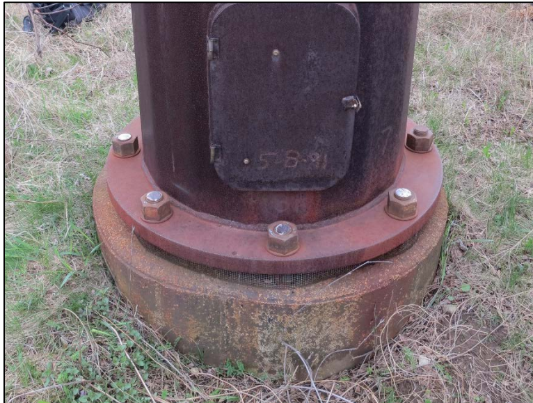
Figure 4.3.3-6: View of Weathering Steel Base Plate.

This assessment element defines the base plates, flanges, gusset plates, seam welds, and welds at the connection of the column support to the foundation. Base plates are typically welded to the pole, and secured to the anchor rods using high strength nuts and washers. Leveling nuts are used below the base plate to align the structure, and the anchor nuts are utilized to secure the plate to the leveling nuts. The base plate transfers loads from the pole to the anchor rods.