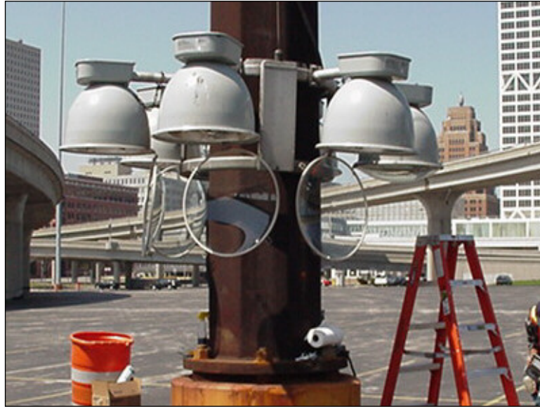
Figure 4.3.5-2: View of a Typical Luminaire Ring, Lowered for Maintenance.