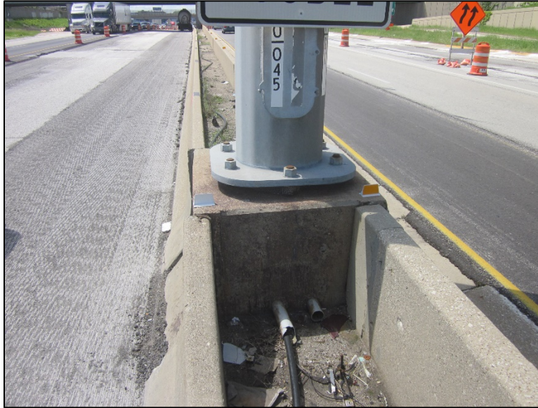
Figure 4.3.4-5: View of Barrier Wall Acting as Crash Protection System for Structure.

Refer to the following assessment states: