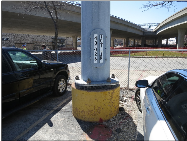
Figure 4.3.4-6: View of a Structure ID Plaque.

Refer to the following assessment states: