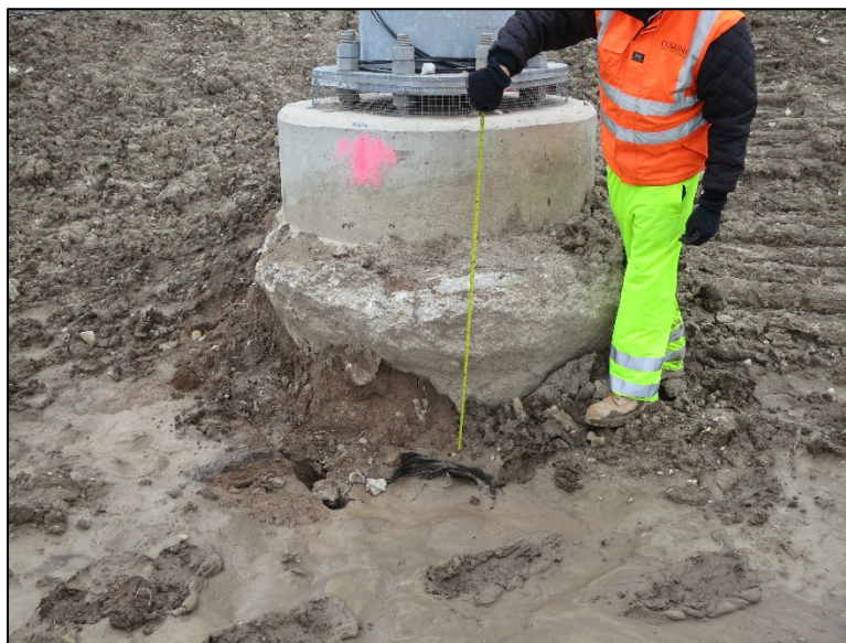
Figure 4.3.3-4: Exposed Foundation Due to Adjacent Construction Work. Condition State 3.