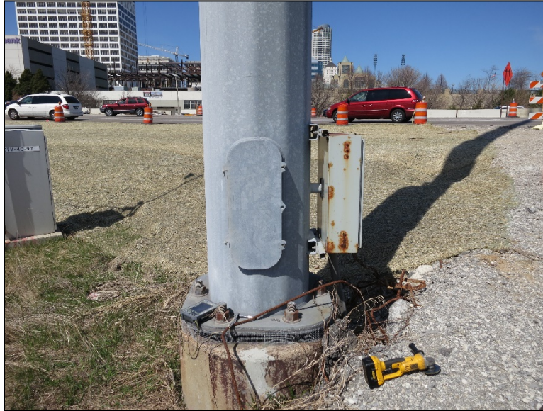
Figure 4.3.4-4: View of a Handhole Cover.

Refer to the following assessment states: