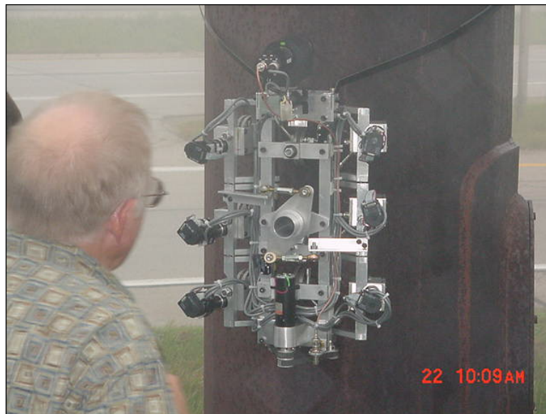
Figure 4.3.5-1: View of a Magnetic Climbing Camera Unit Used During Close Visual Inspection.

If severe deterioration is noted or suspected during the maintenance related or routine inspections, a need for an in-depth inspection may be warranted. A detailed inspection will be scheduled on an as-needed basis.