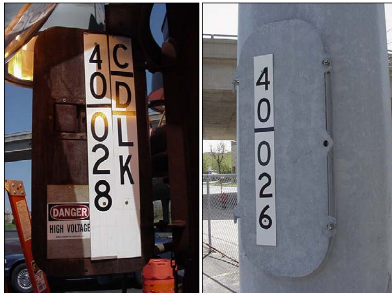
Figure 4.3.5-5: View of the Hatch Doors for Old and New High Mast Light Towers.

Refer to Figure 4.3.5-5 for a close-up view of the hatch doors on an old and a new high mast light tower. There are differences in the door design on the older structures as shown on the left compared to the new structures as shown on the right. The new door is secured with bolts, a lock in easily accessible areas such as Park and Rides, and no longer has a latch. Note that the electrical circuit plaque has not yet been installed on the new structure.