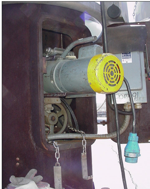
Figure 4.3.5-3: View of the Hatch Opening and Internal Winch System with a Portable Motor.